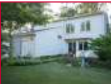
Contemporary home nestled on 2 acres with over 115' of river frontage. $299,900