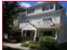
Beautiful end unit Saugatuck Townhome. Walk to town, ideal rental property. $274,500