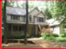
Exquisite 4 BR recreational home with Lake Michigan Beach access. $574,500