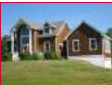
Sophisticated country living at it's best. Stunning 5 BR home on 2+ quiet acres. $255,000