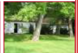
Affordable lake front cottage with 100ft of frontage on Lower Scott Lake. $85,000

Want to be the FIRST to know when new listings come on the market? Ask us how!