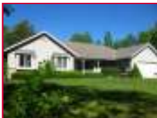
Nicely built 4 BR home on 1.4 wooded acres. Large finished lower level. $235,500