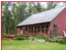
Unique rustic home on 6+ wooded acres, amazing tree house & 30x60 out bldg. $220,000