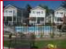
Fantastic 2 or 3 BR Condos, priceless location, stunning harbor views. Starting at $419,000