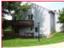
Delightful Mariners Cove end unit. Nature & water views plus a 2 car garage. $280,000