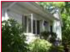
Charming cottage close to Douglas Beach, garage and attached guest area. $296,000