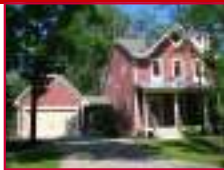
Newer custom built 5 BR cottage style home walking distance to Lk Michigan $449,000