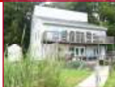
One of a kind home with over 3,300 sf and full waterfront views. Walk to town! $445,000