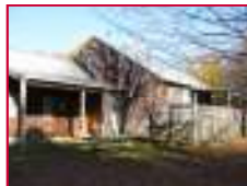
Affordable Saugatuck home on a 1.5 acre setting with a 3 stall garage. $119,500