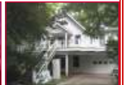
Ideal Douglas getaway ready for you to make your own. Walk to Lk Michigan $265,000.