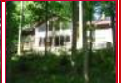
Wonderful, spacious lodge-style home just a short walk to Lake Michigan. $369,500