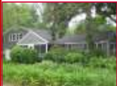
Fine Saugatuck 5 BR year round or rental home. Close to all town activities. $320,000