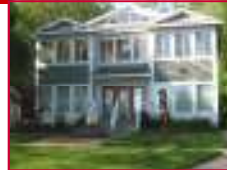
Incredible Saugatuck Offering. Office space with fantastic upstairs penthouse. $429,500